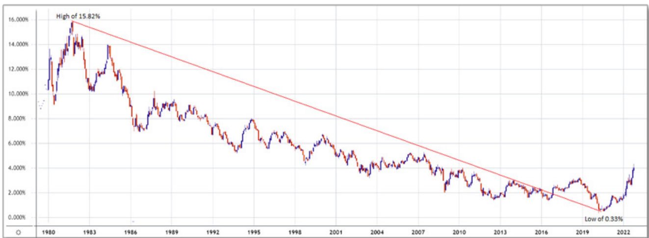
40 years chart of US 10 year Government bond Yield (Depicting a falling trend; that after every rise, the interest rates have consequently fallen)

Here is a chart of various rate hike cycles in US over the period of last 40 years. For the last 40 years whenever interest rate was rising, the question always was how far the rate raise cycle will last. And it was a very legitimate question, as in a structural sense, rate was in a secular falling trajectory. US 10 year bond yield in US in 1982 was 15%+ (yes, in US 40 years back interest rate was 15%+) but kept falling in a structural sense to 0.5% during 2020.