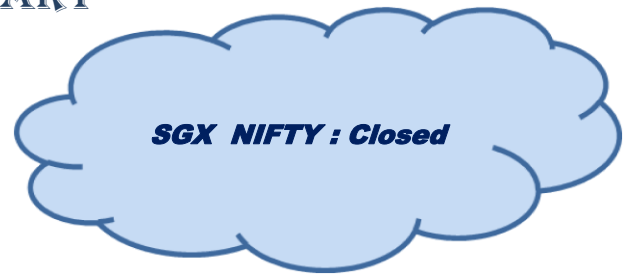
Chart of the Day

"Although I consider myself to be primarily in the quantitative school, the really sensational ideas I have had over the years have been heavily weighted toward the qualitative side where I have had a 'high-probability insight'. This is what causes the cash register to really sing." Warren Buffett