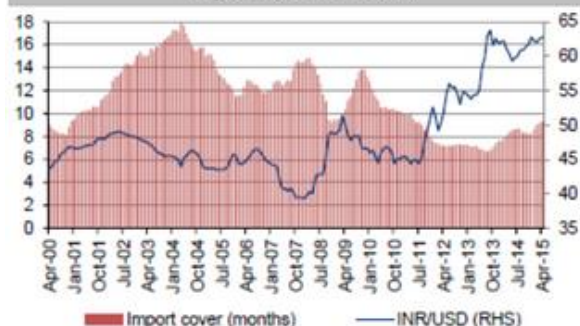
Import Vs INR Trend