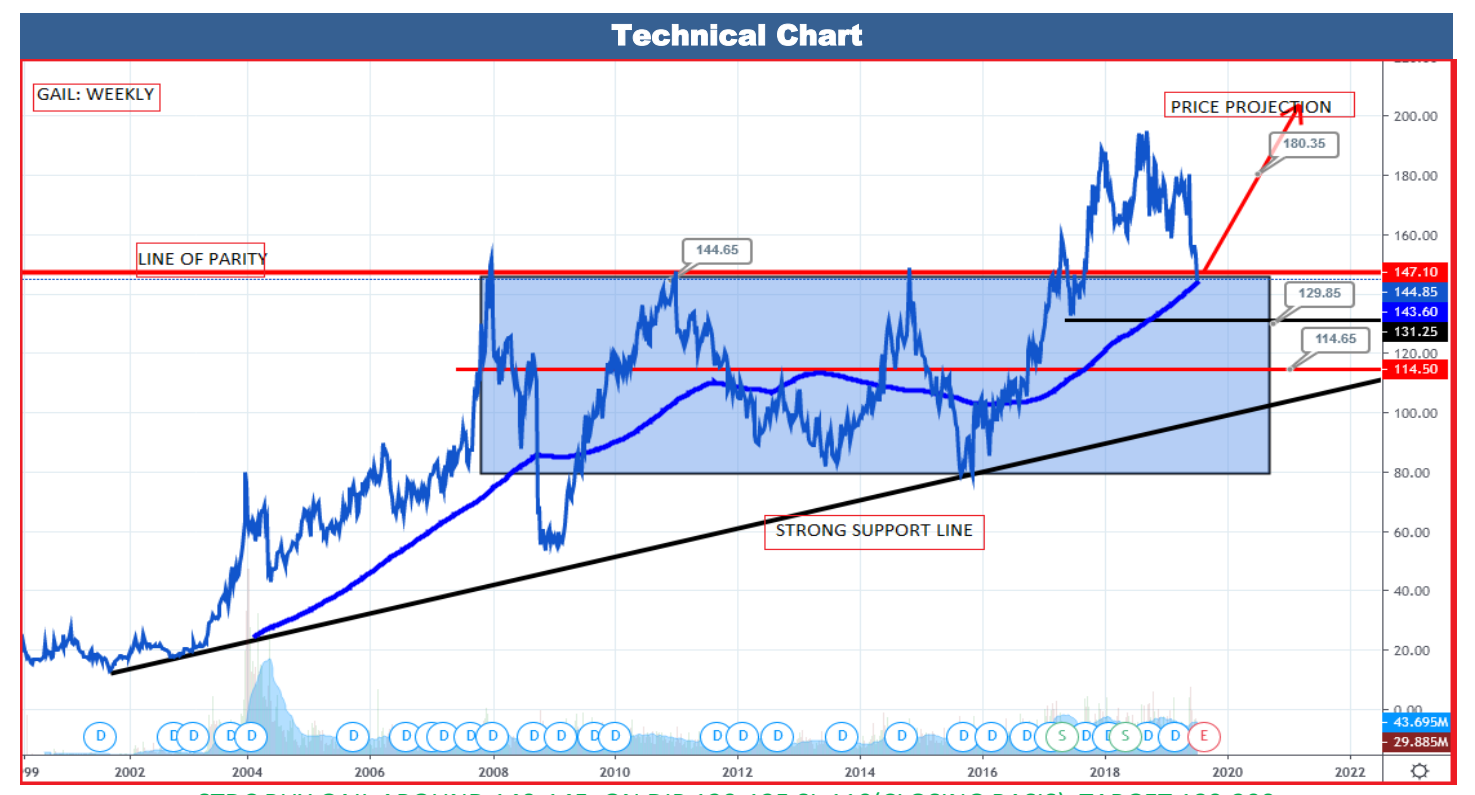
STDC BUY GAIL AROUND 140-145, ON DIP 120-125 SL 110(CLOSING BASIS), TARGET 180-200

Weekly chart of GAIL reveals that demand is increasing and supply is diminishing. Channel support line from lower levels is displaying trend reversal and creates buying opportunity at current juncture. As of now, stock is taking support from its ascending triangle resistance line on monthly chart which augur well for the Bulls and indicate surge on upside . Apart from this, rising Histogram in MACD daily signals optimism, which further suggest upside move in the counter in coming sessions. BUY GAIL AROUND 140-145, ON DIP 120-125 SL 110(CLOSING BASIS), TARGET 180-200