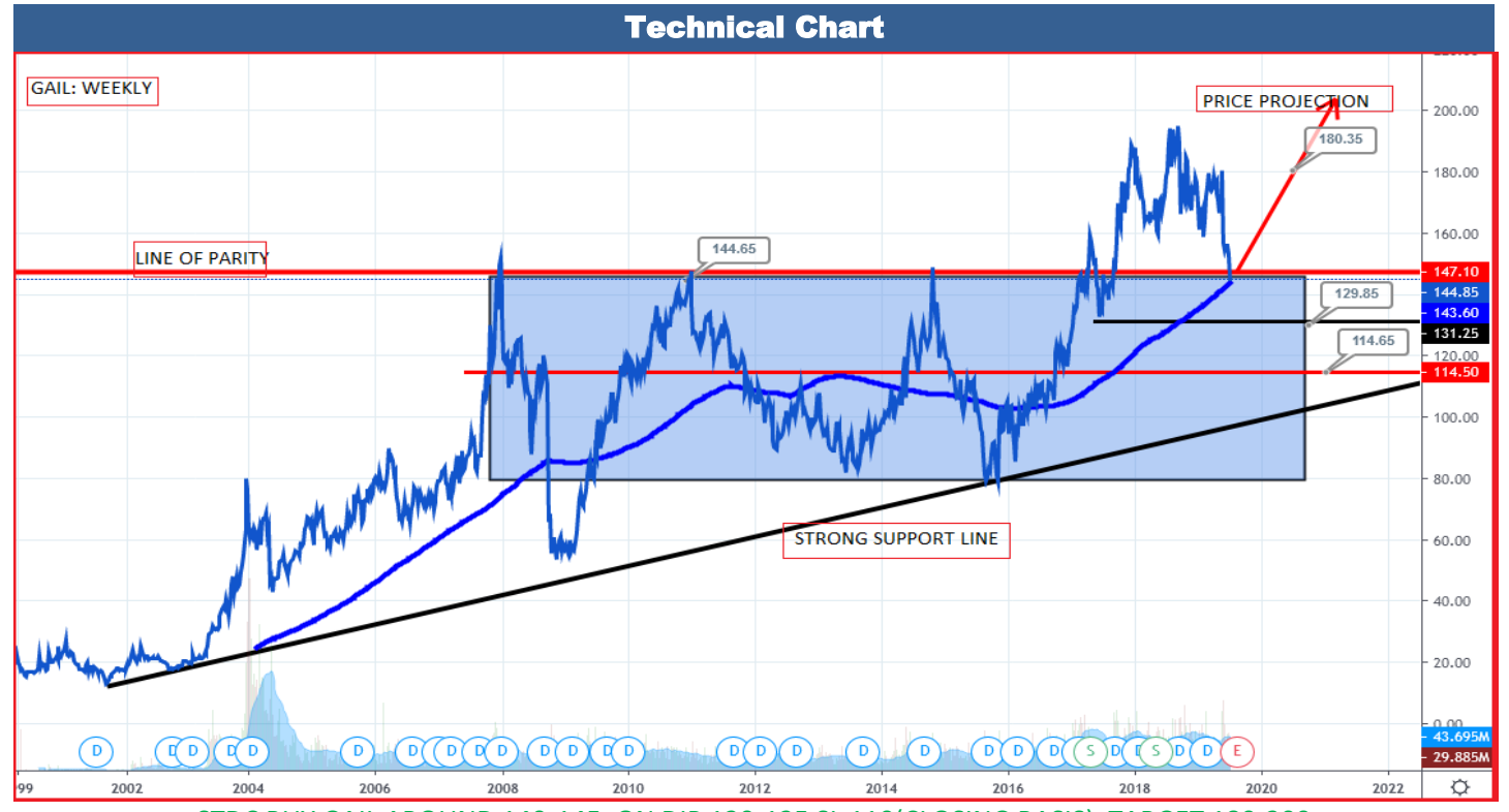
STDC BUY GAIL AROUND 140-145, ON DIP 120-125 SL 110(CLOSING BASIS), TARGET 180-200

Weekly chart of GAIL reveals that demand is increasing and supply is diminishing. Channel support line from lower levels is displaying trend reversal and creates buying opportunity at current juncture. As of now, stock is taking support from its ascending triangle resistance line on monthly chart which augur well for the Bulls and indicate surge on upside . Apart from this, rising Histogram in MACD daily signals optimism, which further suggest upside move in the counter in coming sessions. BUY GAIL AROUND 140-145, ON DIP 120-125 SL 110(CLOSING BASIS), TARGET 180-200