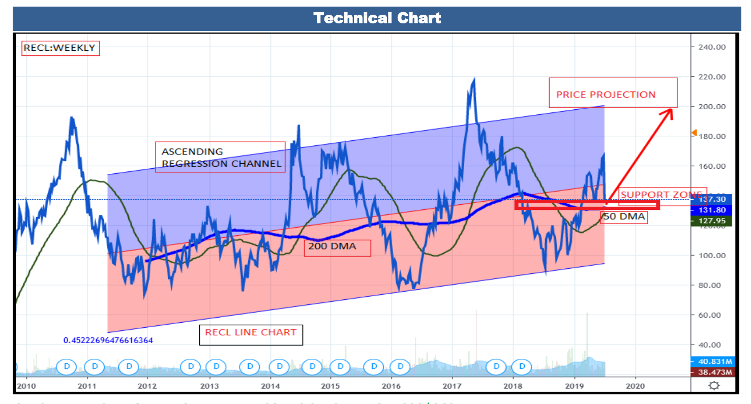
STDC: BUY RECL AROUND 161-155 AND 138-142 SL 125 TARGET 220/260

Scrip is moving in a well defined ascending channel with multiple touch point and appears to be having a strong support around 138- 142 levels as it bounced back couple of time from the demand line. It also maintained its uptrend on the long term chart and is trading well above its short and long term moving averages(20/ 50 /200 DMA). The momentum oscillator, RSI is also favors the price pattern. One can accumulate the stock around 155 and lower around 138-142 zone for an upside target of 220/260 and a stop loss should maintain 125 closing basis.