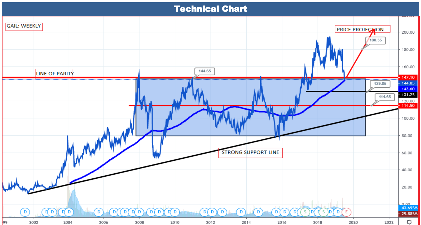
STDC BUY GAIL AROUND 140-145, ON DIP 120-125 SL 110(CLOSING BASIS), TARGET 180-200

Weekly chart of GAIL reveals that demand is increasing and supply is diminishing. Channel support line from lower levels is displaying trend reversal and creates buying opportunity at current juncture. As of now, stock is taking support from its ascending triangle resistance line on monthly chart which augur well for the Bulls and indicate surge on upside. Apart from this, rising Histogram in MACD daily signals optimism, which further suggest upside move in the counter in coming sessions. BUY GAIL AROUND 140-145, ON DIP 120-125 SL 110(CLOSING BASIS), TARGET 180-200